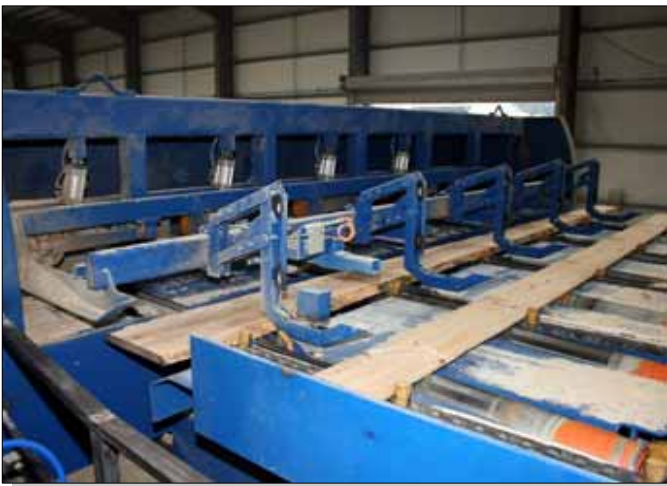
In feed for the edger BCO 800/60