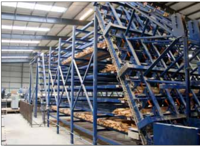
The tray sorting line