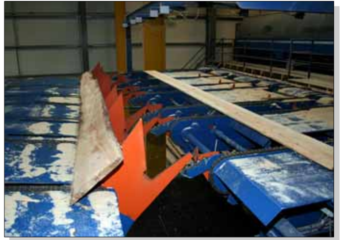
Board turner in sit down operated edging line