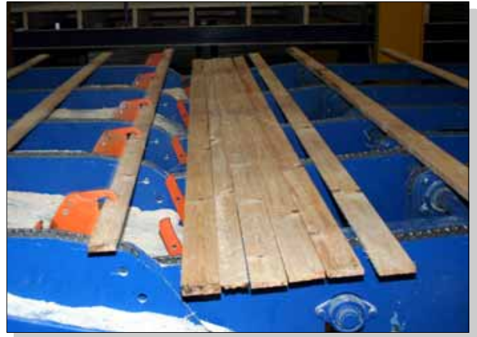
The BCO Speed Feeder getting a secure grip