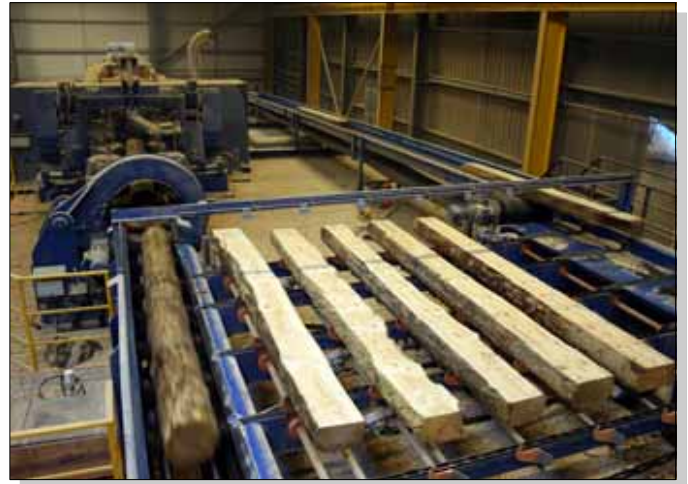
Big section cants in line for second pass