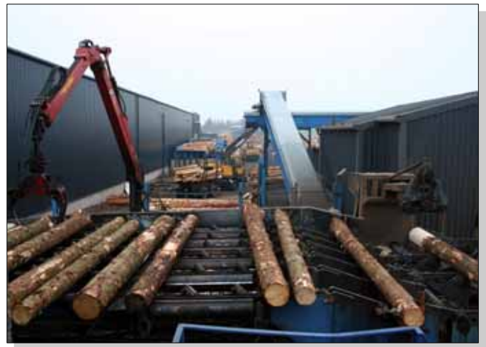
Butt reducing logs before sorting