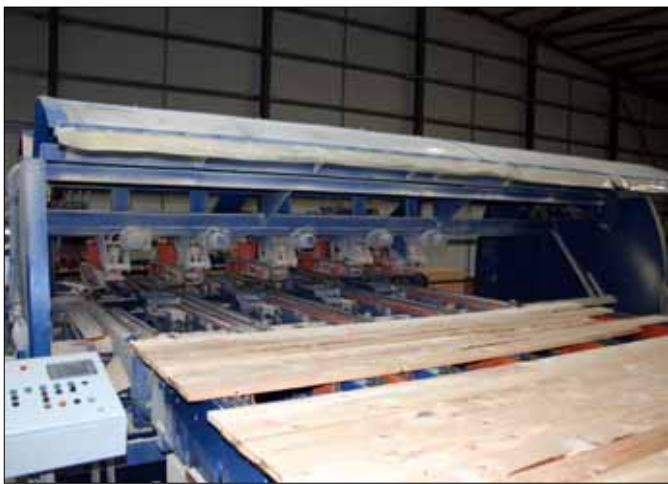
The BCO 5/100 with the covers up