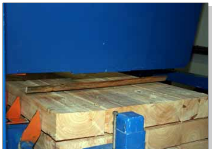
Stacking main product sections 100 x 300 mm