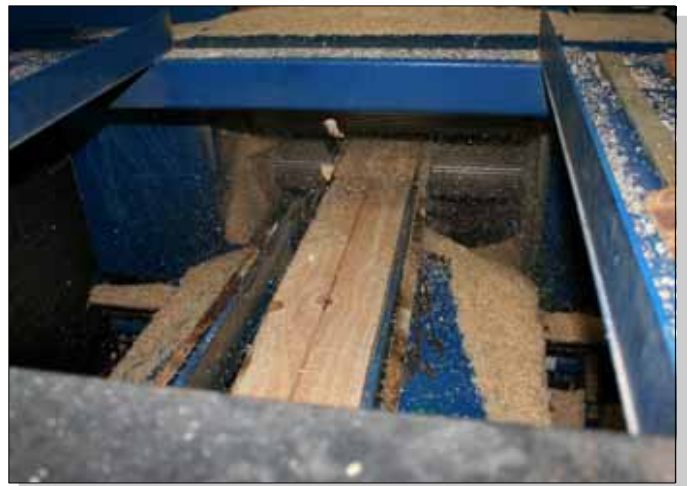
Out feed from edger