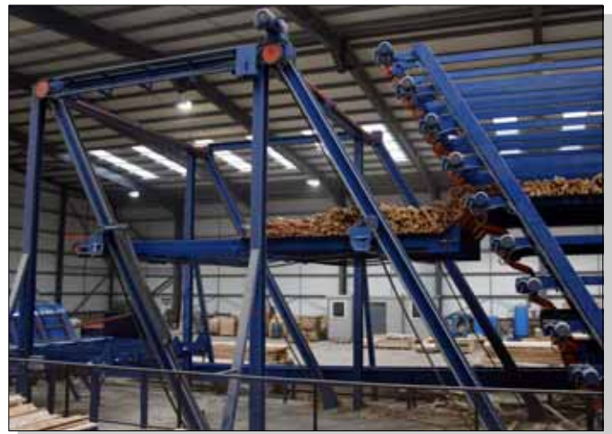
Emptying a tray