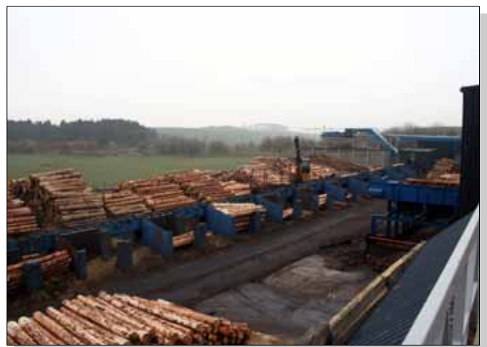
Part of the log sorting line – log intake for the saw line is seen to the right