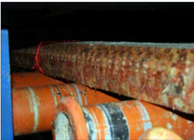
3D cant scanning Microtec DiShape