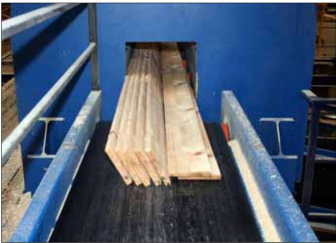
Main product out feed from multi rip saw BCO 1000/180