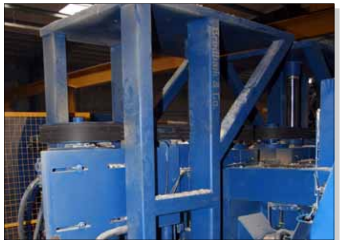
The new profiler BCO 300